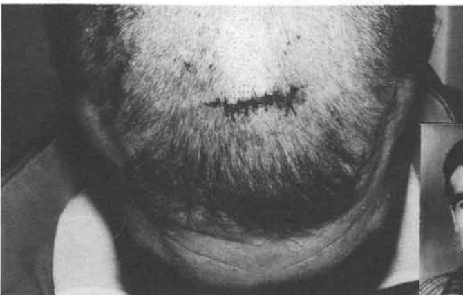
A Kurdish protester who received a severe head wound during the embassy demonstration

If you were arrested, or know of anyone else who was, at the anti-fascist mobilisation in Tower Hamlets, please contact CAPA, Oxford House, Derbyshire Street, London E1; 071-729 2652.