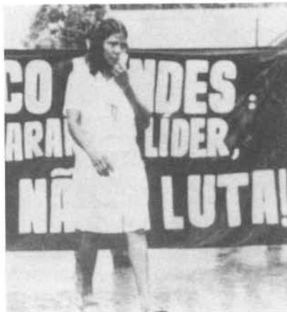
'Chico Mendes – they have killed our leader but not our struggle', read the banner at his funeral.

being waged, but other questions remain. The network of powerful interests that Mendes indicated was operating behind the Alves da Silva family has not been exposed. And the Brazilian government has not yet decided whether to implement or rescind the CNS's plans for extractive reserves. Meanwhile, leaders of the CNS and of the rubber tappers' union continue to live under the threat of death. ■