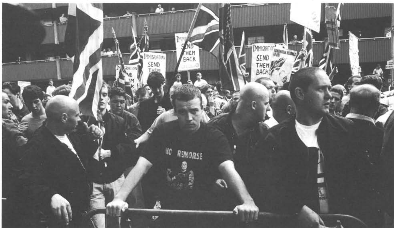
'No Remorse' follower at the BNP 'Rights for Whites' mobilisation, Bermondsey, August. 'No Remorse' is a National Socialist band - part of the Blood and Honour network - that supports the British Movement. Titles include: Hail the Order and Did six million really die?