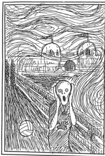
The fans' road to Wembley as seen by Foxes Against Racism, the anti-racist campaign among Leicester City fans. FAR has just produced its first fanzine, Filbo Fever . It costs 50p and is available from Foxes Against Racism, c/o 70 High Street, Leicester.

What the fans seem agreed upon is that if the considerable resources of the PFA/CRE can be combined with the experiences and campaigning work of the fans themselves, then a pretty vital force can be created to kick racism out of football. A meeting between the CRE/PFA with the Football Supporters Association and the National