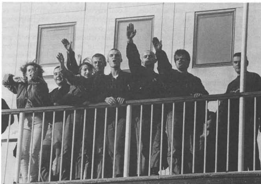
The party was over for these Blood & Honour supporters when they met fierce anti-fascist opposition at the 'Battle of Waterloo' on 12 September. But British nazis are taking heart from events in Germany. And the Blood & Honour network has firm links with the Rock O Rama label based in Bruhl, western Germany, and with bands like Auslander Vernichtungs Kommando (Foreigners Annihilation Squad), Noie Werte (New Values), Störkraft (Disruptive Power) and Endstufe (Final Stage).